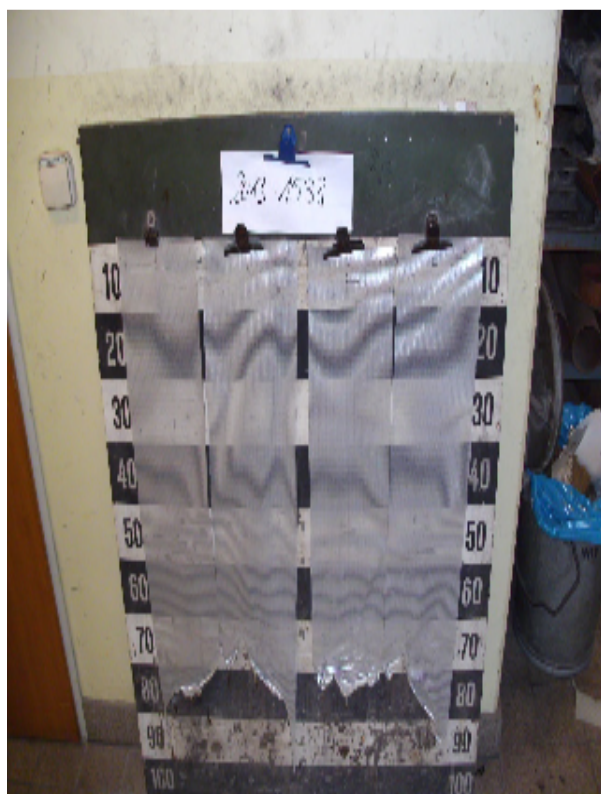
Sample A Length direction